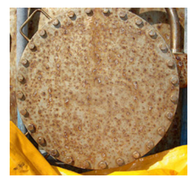
Before and after cleaning.