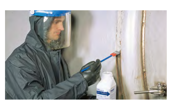
Avesta Pickling Gel 122 is easy to apply thanks to its free-flowing consistency.